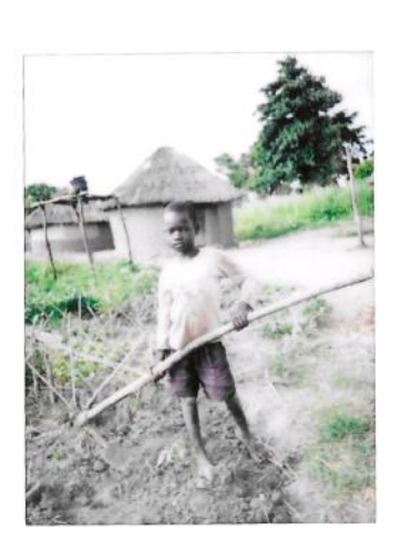
Boy digging -

In Adjumani, host community members who had land also described insufficient rains affecting their crop yield, although to a lesser degree than in Moroto. In Adjumani, poor post-harvest storage was also raised by adolescents, who reported that it was compounded by lack of seeds and farming tools, and limited knowledge about farming methods, including irrigation and crop rotation. In their photowalk activities, adolescent girls in Adjumani documented pest infestations such as army worm, described by caregivers as being a 'disaster' for their crops. One of the main issues emphasised by participants in Adjumani was land ownership and access. With the rapid influx of refugees due to the escalating conflict in South Sudan, programme implementers in Adjumani Town reported being 'overwhelmed by the number of refugees in the area'. With limited funding, programmes had been forced to cut rations, and the size of allocated rations was a concern prioritised by adolescents in Mungula, Adjumani. Participants from the refugee community explained that the plots of land they were allowed to rent were too small to produce sufficient food to supplement rations. It was notable that adolescent girls chose to document this